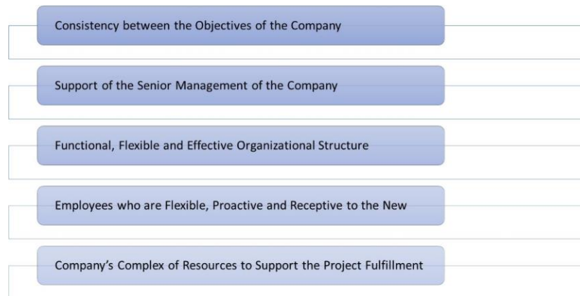
Figure 3. 5 factors which can favour the development of the intrapreneurial environment within a company.