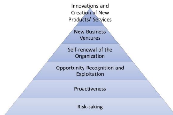
Figure 2. The Roles of an Intrapreneur