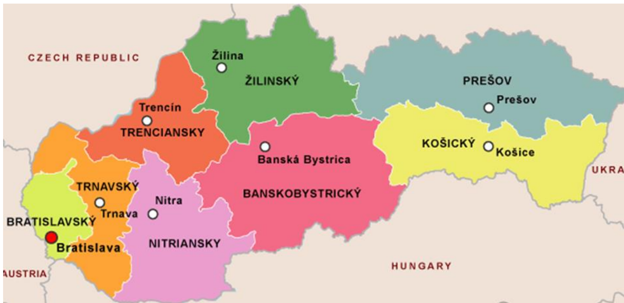
Figure 1. Division of Slovakia into the self-governing regions

When evaluating accessibility, we took into account the information provided on relevant websites, which were compared to eliminate duplication. We verified the obtained information by a personal visit, by phone, resp. by photo documentation available online. In the survey of accommodation facilities, we included only hotels, boarding houses and apartment houses as the most numerous categories of accommodation establishments in Slovakia, the numbers of which are listed by the Statistical Office of the Slovak Republic on the website statdat.statistics.sk in the category Capacity and performance of accommodation establishments. The survey was conducted continuously over a longer period of time (2016 - 2020) in all (8) self-governing regions of Slovakia (Figure 1).