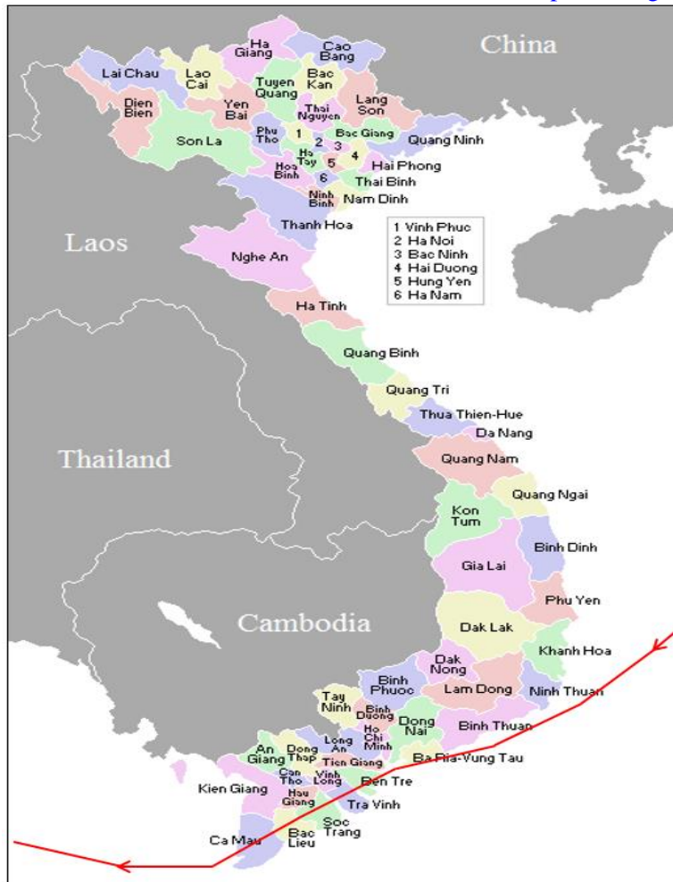
Figure 1. Map of Vietnam and track of typhoon Durian