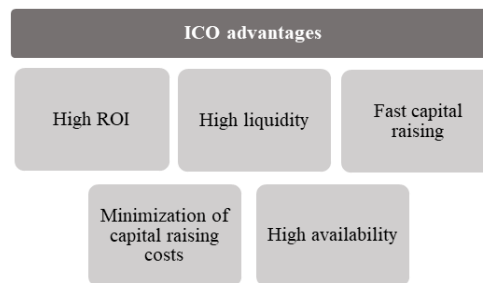
Fig. 1. The advantages of ICO that are usually analysed in scientific literature.

Until the emergence of ICO, in order to attract financing companies used traditional financing methods, such as bank loans, stocks, venture capital, crowdfunding, etc. Obviously, the ICO has a lot of similarities to other ways of raising capital. As Barsan (2017) points out, ICOs are similar to Initial Public Offering (IPO), where companies sell part of their capital on the stock market and crowdfunding, when funding is drawn from a heterogeneous group of investors on virtual platforms. With the growing popularity of ICO, as Amsden and Schweizer (2018) point out, entrepreneurs quickly realized that the ICO could be structured to resemble other forms of financing that are already developed, such as shares, bonds, crowdfunding, venture capital, private equity funds, hedge funds, etc. According to Ofir and Sadeh (2018), the rapidly growing popularity of ICO was accelerated by their use as a protection against volatile local currencies and geopolitical risks, distrust of the traditional banking sector after 2008 global financial crisis and increased media attention. The ever-growing popularity of ICO shows that ICO offers a number of advantages to both investors and businesses or entrepreneurs that motivates them to choose exactly this type of financing or investment (see Figure 1).