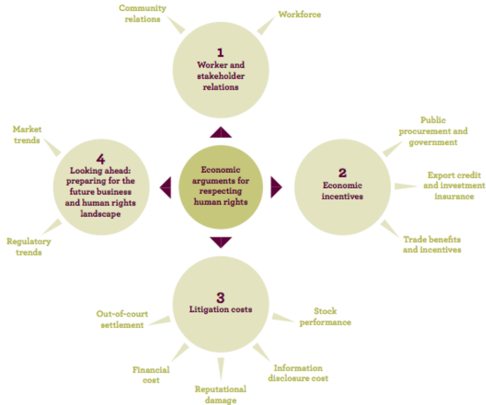
Figure 2. Key economic drivers for businesses in respecting human rights.

Make your research more visible, join the Twitter account of ENTREPRENEURSHIP AND SUSTAINABILITY ISSUES: @Entrepr69728810